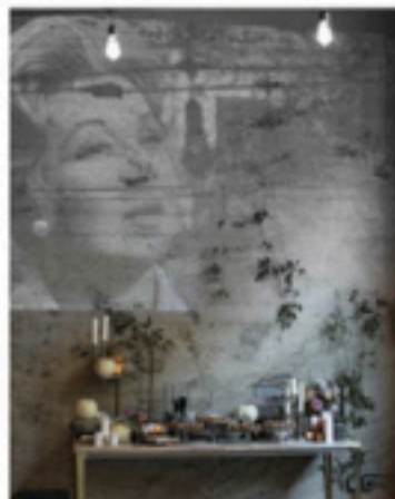
1964 film The Best Man brought in a unique vintage vibe, luring guests to check out the dessert offering of the evening.