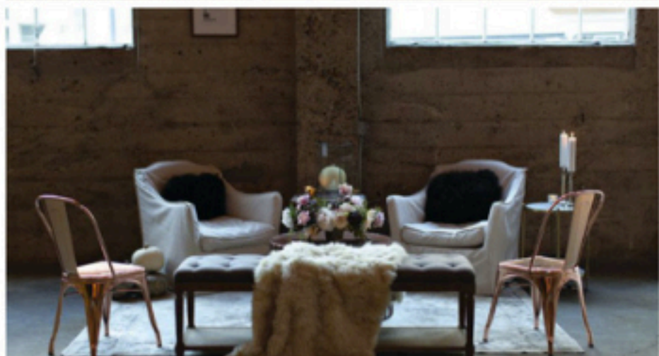
Archive filled the space with various intimate lounges, designed with a mix of modern and luxurious pieces.