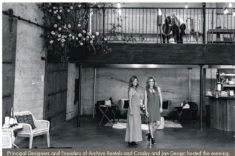
Principal Designers and Founders of Archive Rentals and Crosby and Jon Design hosted the evening.